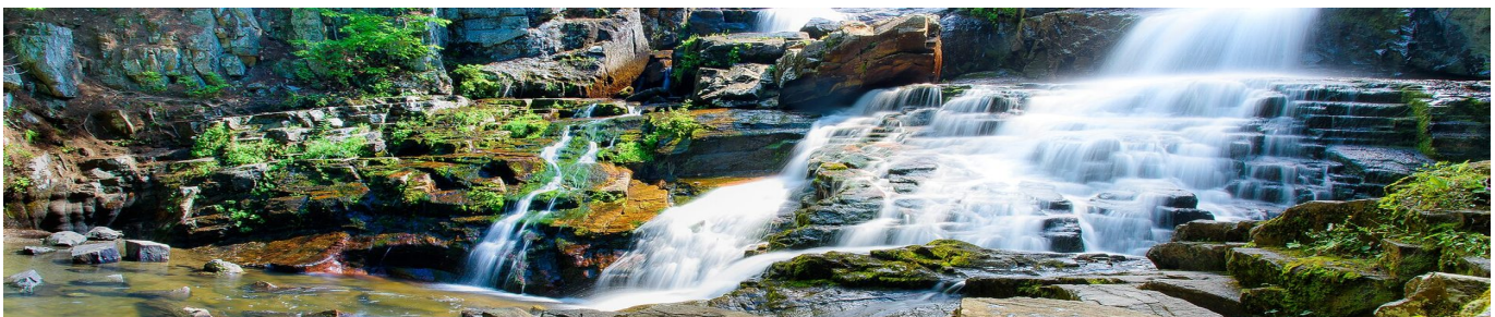
Shelving Rock Falls, Lake George east shore

BACKUP Frederick's Restaurant, Bolton Landing — Continental, steaks & seafood