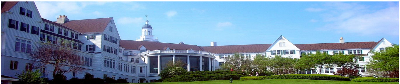
The Sagamore Resort, Bolton Landing